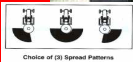
Choice of (3) Spread Patterns