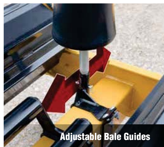
Adjustable Bale Guides

Add some value to your operation with a new Individual BaleWrapper from Tubeline.