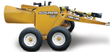
Raised - Transport Position