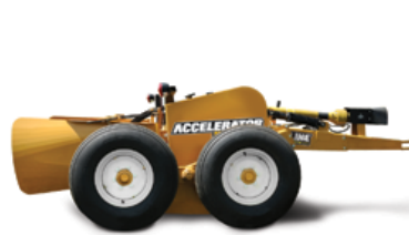
Lowered - Low ground clearance ensures no hay is missed

The Accelerator's easy operation conditions hay by simply running it through adjustable steel crimping rollers, up to 15 mph. This process cracks the hay stems without knocking off the leaves. Conditioning also fluffs the hay, allowing air to flow through the swath, for faster and more even drying from top to bottom. Speed up your operation with the Tubeline Accelerator producing better hay, faster drying time and bigger profits. Contact your authorized Tubeline dealer for more details.