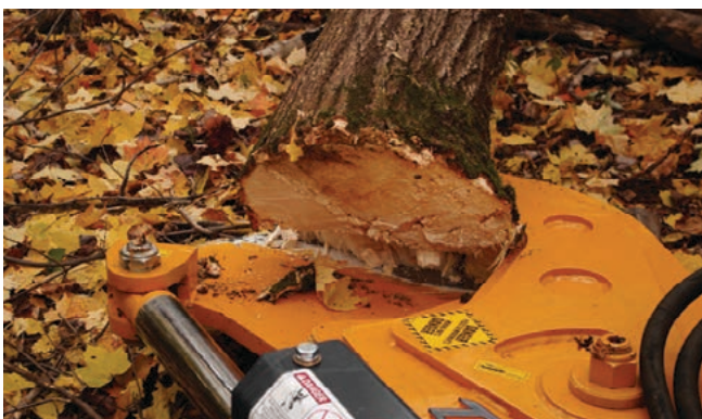
Cuts through grain without bending