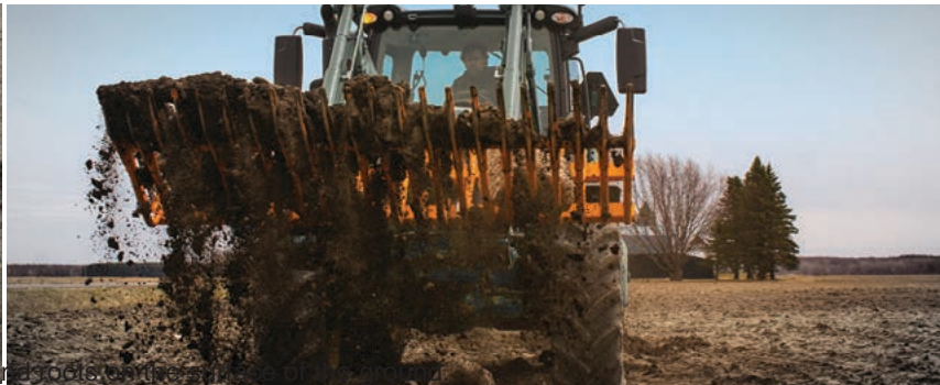
The BBW and BB Model buckets are ideal for picking up rocks and roots at the surface.