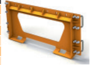
Skid Steer plate