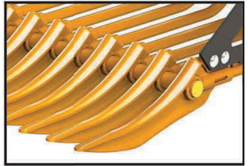
Shoule's model tips are made of cast steel that will not bend or break even under the most rigorous conditions