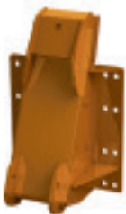
Ford New Holland TV140