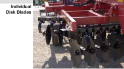
Individual Disk Blades

Hydraulically adjustable leveling disk system with depth indicator levels ridges left by chisel shanks. Individually mounted cushion bearing standards ensures long life and dependability.