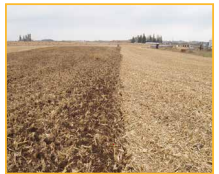
A side by side comparison of a corn field with heavy residue worked in the fall with the

A rolling basket option which features our CT-3 bar harrow and 15" diameter, 7 blade 5/16 x 3/4, 1045 steel rolling basket.