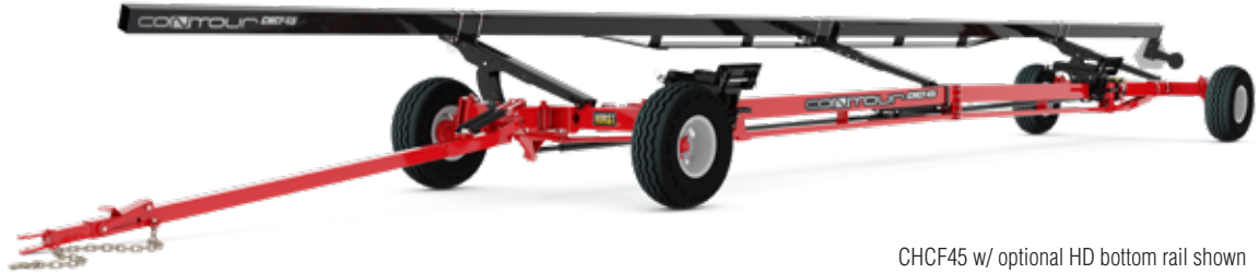
CHCF45 w/ optional HD bottom rail shown