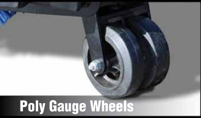
Poly Gauge Wheels