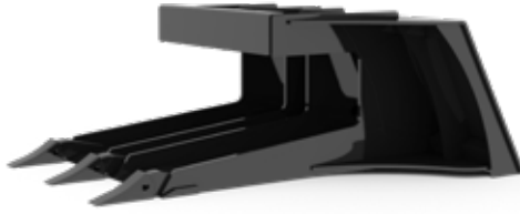
CSB (shown with optional thumb)