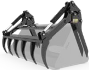
GR66 (bucket not included)