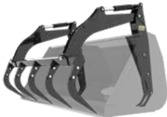
GRX96 (bucket not included)