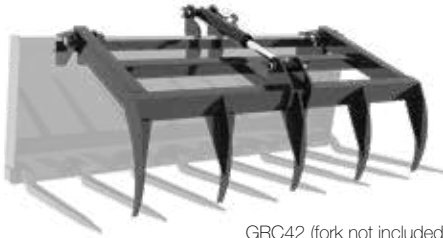
GRC42 (fork not included)