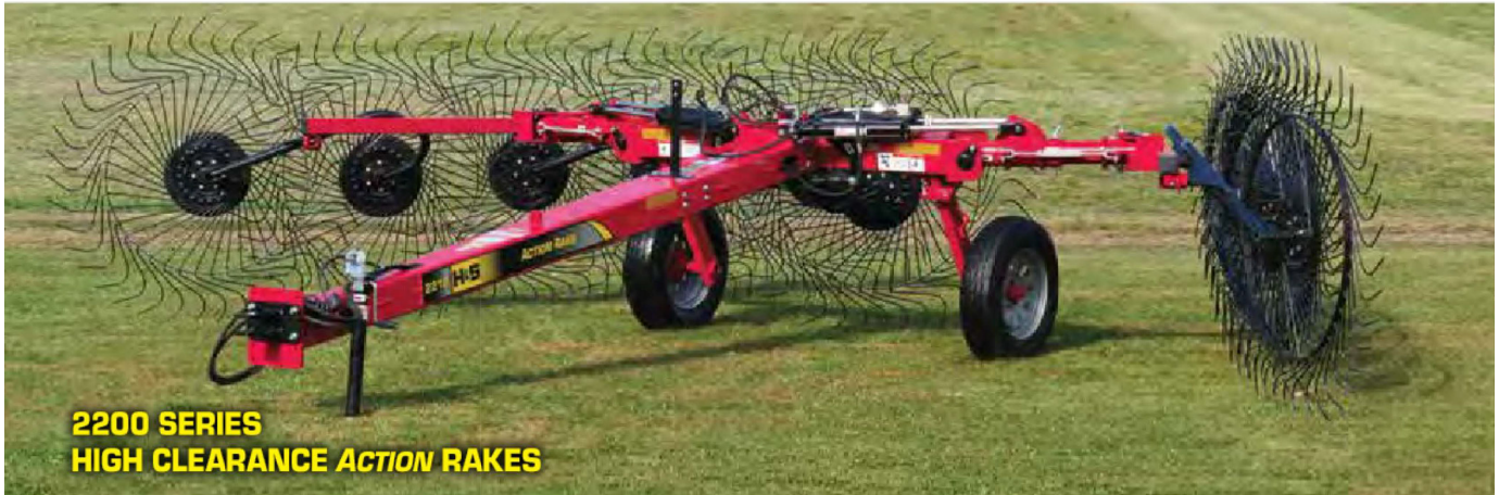
2200 SERIES HIGH CLEARANCE ACTION RAKES