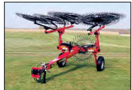
Rake in transport position with optional Center Kicker Wheel. 2200 series rake shown.

The 2200 & 3200 series ACTION rakes backbone and wing design allows the uniform release of crop when raised for a finished windrow!