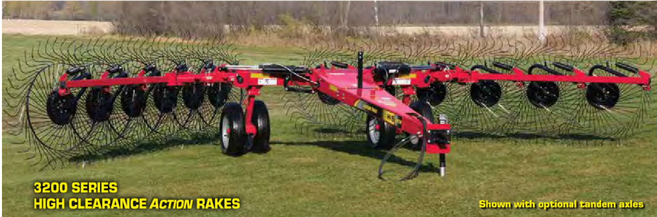
3200 SERIES HIGH CLEARANCE ACTION RAKES