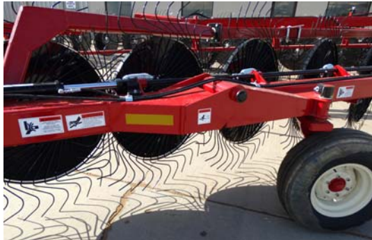
Rake Beam Flex-Joint