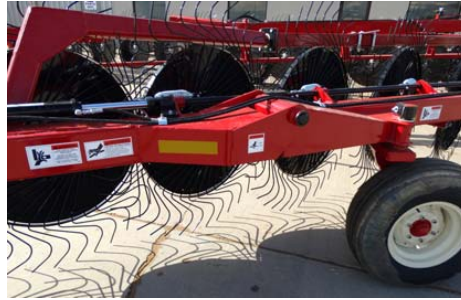
Rake Beam Flex-Joint