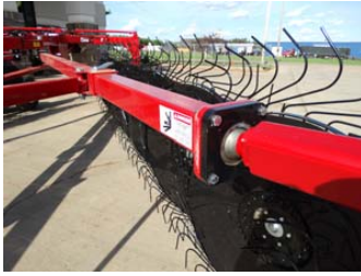
Rake Arm Flex-Joint