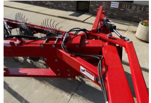
Optional Hydraulic Rear Windrow Adjustment