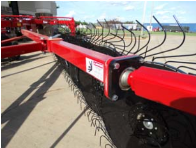
Rake Arm Flex-Joint