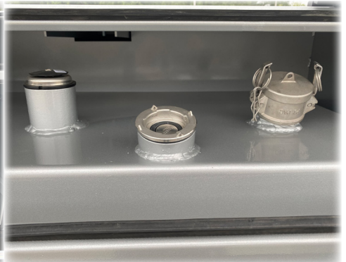
801815 DEF QUICK FILE VALVE