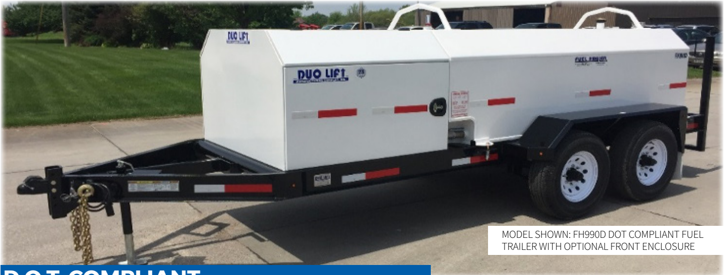
MODEL SHOWN: FH990D DOT COMPLIANT FUEL TRAILER WITH OPTIONAL FRONT ENCLOSURE