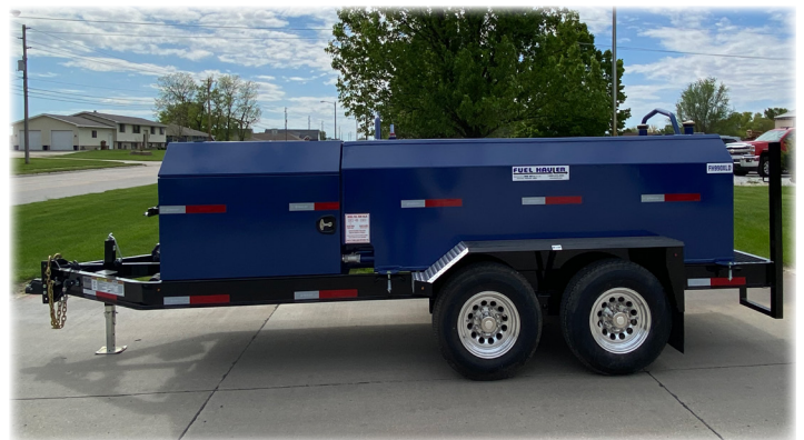
60246 DUO LIFT BLUE PAINTED DIESEL FUEL TANK AND FRONT ENCLOSURE, 801013 ALUMINUM DIAMOND PLATE GRAVEL GUARD