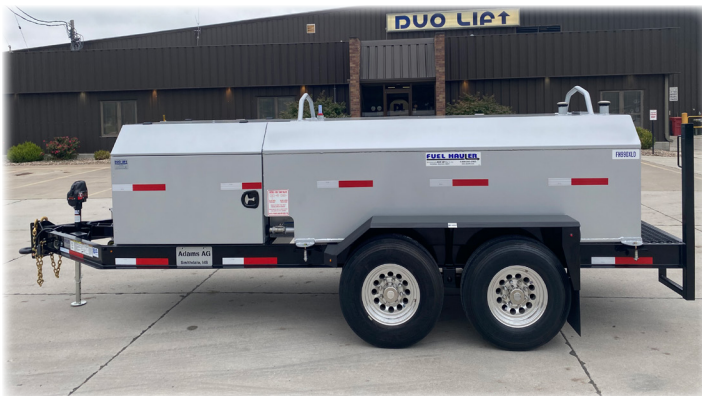
60381 SILVER PAINTED DIESEL FUEL TANK AND FRONT ENCLOSURE, 60225 ALUMINUM WHEELS