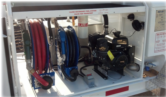
KOHLER POWERED 30-35 GPM DIESEL PUMPING SYSTEM, 12V DEF PUMP AND HOSE REELS