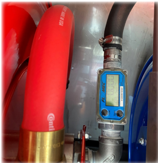
800859 DIESEL FUEL METER