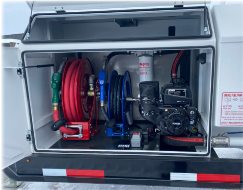
DIESEL FUEL AND DEF PUMPING SYSTEMS