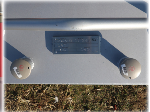
LOCKING PRE-VENT CAPS WITH TANK VENTING AND DIESEL TANK IDENTIFICATION PLATE