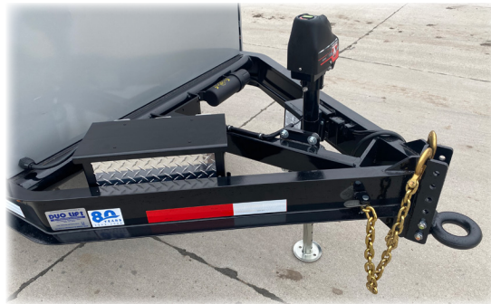
60287 ALUMIUM BATTERY BOX, 60356 12V ELECTRIC DROP LEG JACK, 801066 LUNETTE EYE HITCH