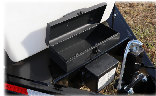
802062 TOOL BOX KIT