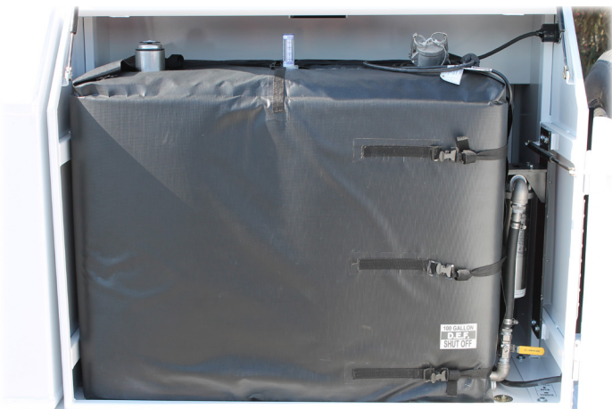
OPTIONAL 50, 80 OR 100 GALLON D.E.F. SYSTEMS (100 GALLON SHOWN) OPTIONAL 120V 835 Watt, Auto Temperature Controlled, D.E.F. Tank Heater Blanket (40°F to -10°F Operational Tempera-