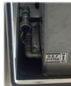
D.E.F. TRANSFER SYSTEM OPTION