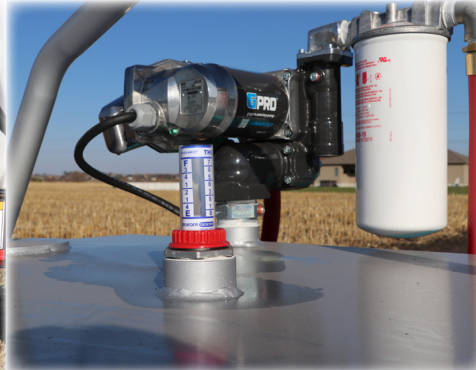
DIESEL FUEL GAUGE, 12V 25 GPM DIESEL PUMP