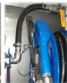
PATENT PENDING DIESEL AND D.E.F. STAINLESS STEEL NOZZLE HOLDERS W/ DRIP CONTAINMENT TUBES