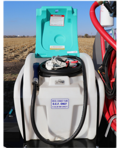
SHOWN ABOVE: 802063 OPTIONAL 55-GALLON D.E.F. PUMPING SYSTEM