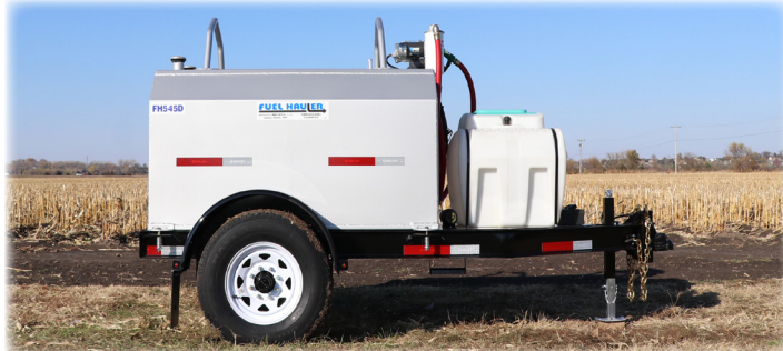
SILVER PAINTED DIESEL FUEL TANK, BLACK TRAILER COLOR