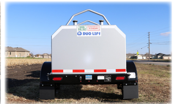
REAR BUMPER, TAILLIGHTS, LICENSE PLATE LOCATION AND VIN ID PLATE