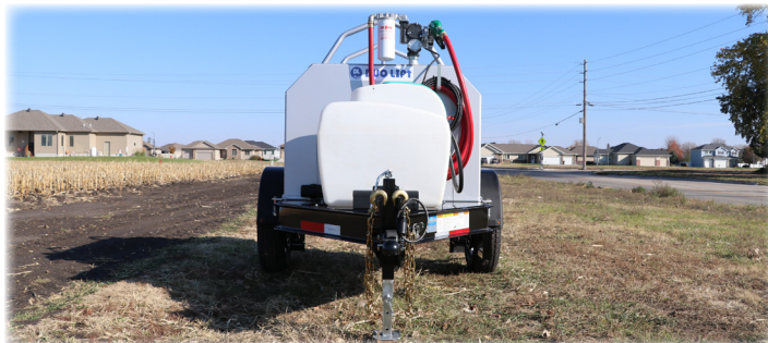
7,000 LB DROP LEG, BOLT ON TOP-WIND TONGUE JACK