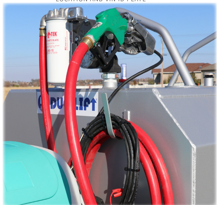
12V, 25 GPM DIESEL PUMP, 25' HOSE, 30' POWER CORD AND DIESEL FUEL FILTER