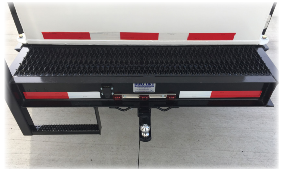
801497 REAR RECEIVER HITCH