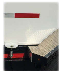
SPRING CUSHIONED, BOLT-ON DIESEL TANK