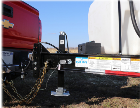
2-5/8" ADJUSTABLE BALL COUPLER, SAFETY CHAINS AND 7-WAY RV CONNECTOR