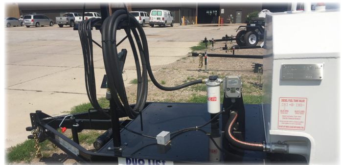
12V, 20-25 GPM DIESEL PUMPING SYSTEM WITH 25' DIESEL HOSE