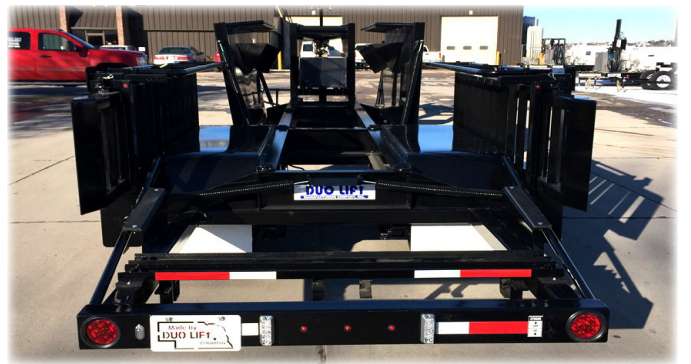
FOLDED TRANSPORT POSITION USING DUAL SPRING LIFT ASSIST FOR FOLDING ALL PLATFORMS. OPTIONAL 801158 STROBE LIGHT PACKAGE