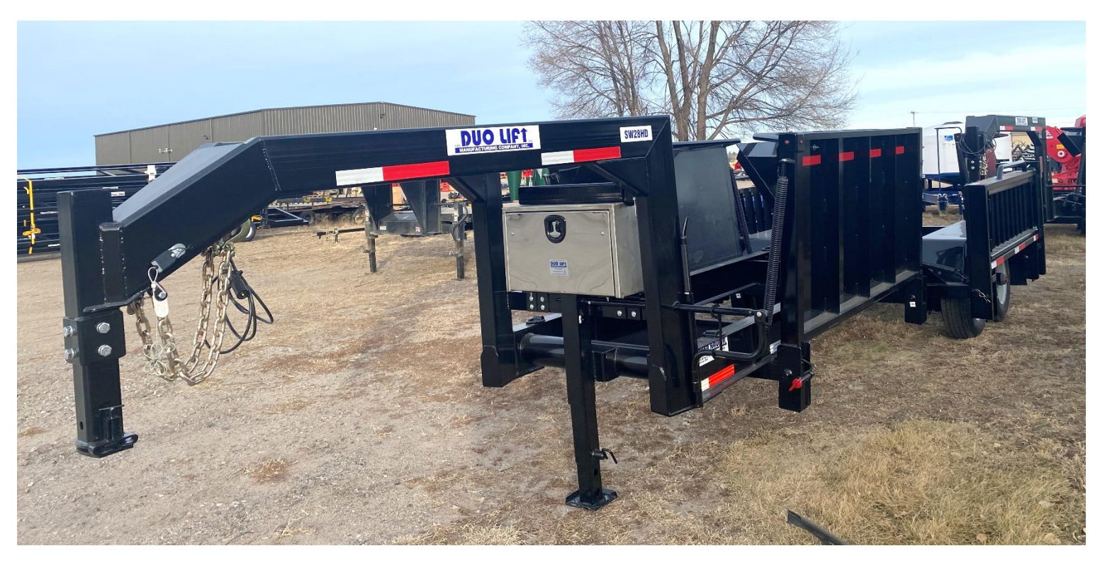
Shown with P/N 801079 Toolbox Option