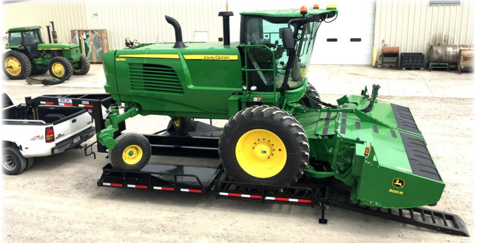
LOADING A 16' SP WINDROWER ON A SW30XD