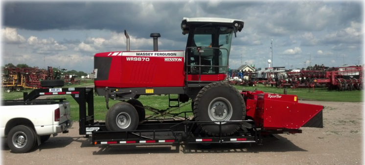
LOADED 16' ROTARY DISC WINDROWER ON A SW25D