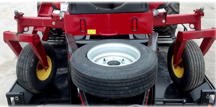
FOLDING CASTER WHEEL ROTATION AND SUPPORT PLATFORMS WITH ADJUSTABLE POSITION TIRE ANGLING GUIDE STOPS