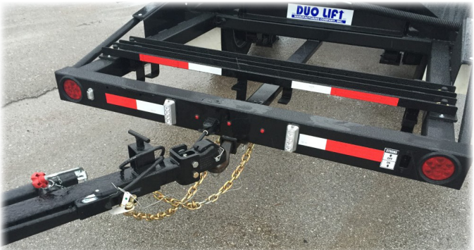
REAR HITCH IS INCLUDED ON THE SW25HD, SW30HD AND SW30XHD MODELS

WINDROWERS CAN BE LOADED WITHOUT A HEADER