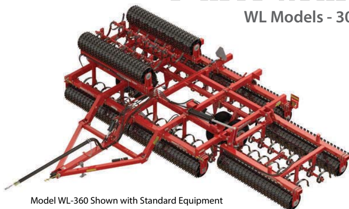
Model WL-360 Shown with Standard Equipment

With a working width of 30 feet and an operating weight in excess of 13,000 lbs., these WL Pulvi-Mulcher models provide the ultimate in high capacity seedbed preparation. These units are flat folding for a very manageable transport width and height. Choice of Notched or Crowfoot Ductile Iron wheels and choice of s-tines or c-tines allow these machines to be set up to match differing soil types.