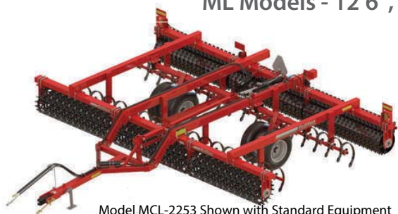
Model MCL-2253 Shown with Standard Equipment

ML Models - 12'6", 13'10", 15'2" & 18'9"