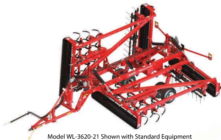
Model WL-3620-21 Shown with Standard Equipment

The 3620 Series Pulvi-Mulcher, a two-section folding unit, features taller and stronger two-piece s-tine shanks with additional clearance for improved residue flow through the machine. 8" roller axles with heavy-duty bearings improve reliability and reduce down time. The 21' model utilizes a hydraulic down pressure system for even machine weight distribution across the width of the machine. Choice of Notched, Crowfoot or Optimizer® Ductile Iron wheels allow machines to be matched to varying soil types.