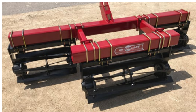
15 foot option