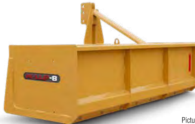
Pictured: LLP-8 3PH Model Shown