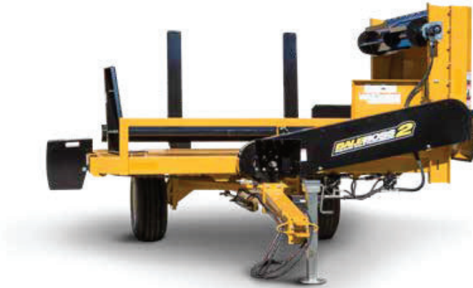
Optional Special Track Width Shown