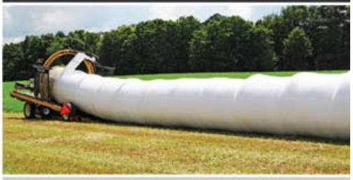
Deck to ground contact provides the friction needed for a tight pack between bales.