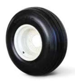
12.5L x 15 12 Ply