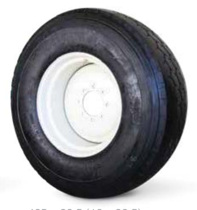
425 x 22.5 (16 x 22.5)