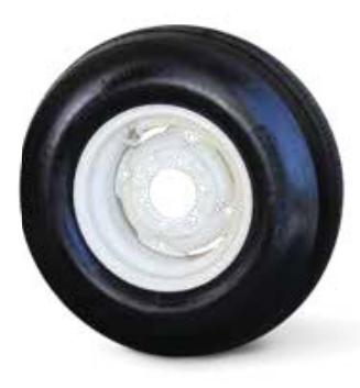
11L x 15 Load Range D