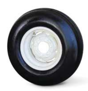
11L x 15 Load Range F