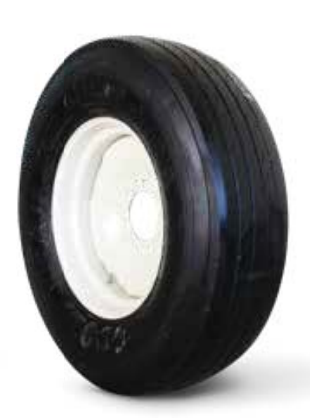
12 or 315 x 22.5