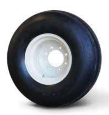
12.5L x 15 Load Range F

Available Sizes: 550/45 x 22.5 16 Ply 400/55 x 22.5 16 Ply