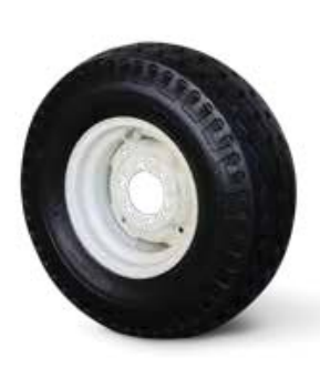
11L x 15 Load Range F