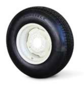
235/85 R16 Load Range F