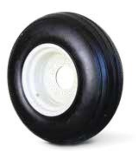
12.5L x 16 14 Ply