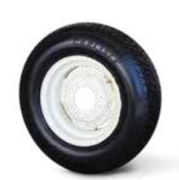
225/75 R15 Load Range D