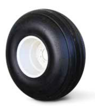
16.5 x 16.1 10 Ply