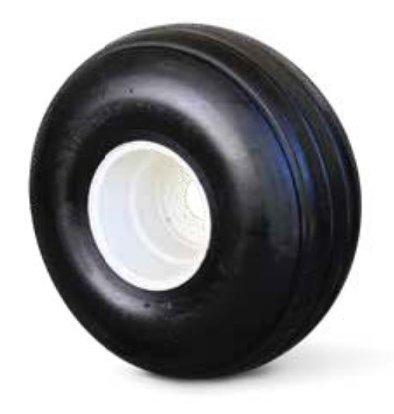
21.5 x 16.1 14 Ply