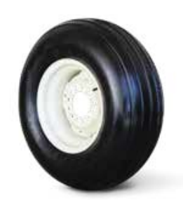
11L x 15 8 Ply