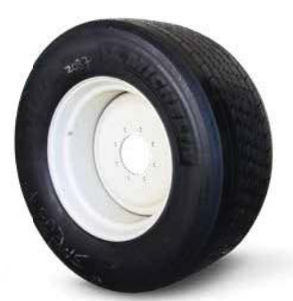
445 / 50 x 22.5