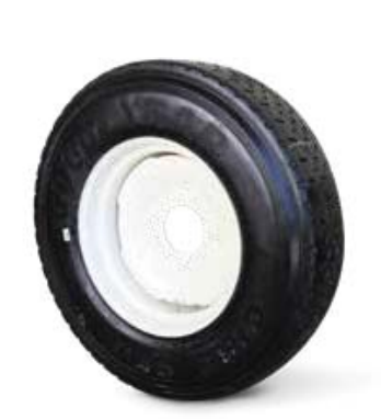
11 x 22.5