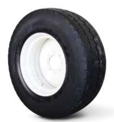
385 x 22.5 (15 x 22.5)