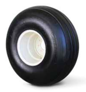
19L x 16.1 10 Ply