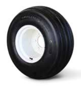
26x12 12 Ply