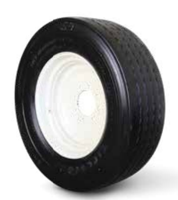
305 x 22.5