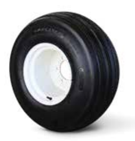
26x12 12 Ply