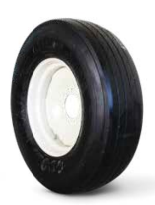
12 or 315 x 22.5