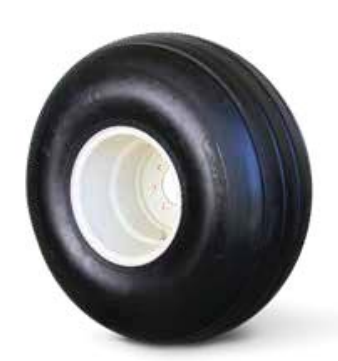
19L x 16.1 10 Ply