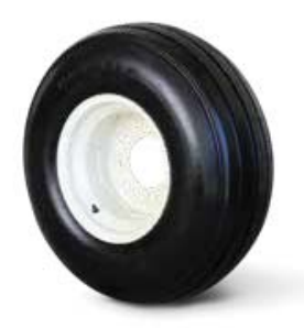
12.5L x 15 12 Ply