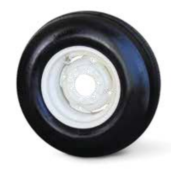
11L x 15 Load Range F