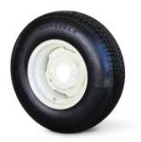
235/85 R16 Load Range F