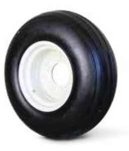
12.5L x 16 14 Ply