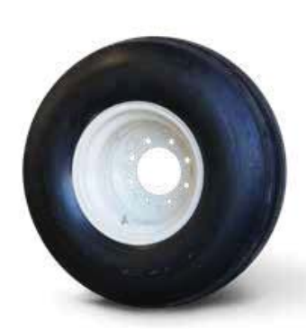
12.5L x 15 Load Range F