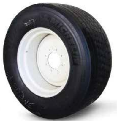
445 / 50 x 22.5