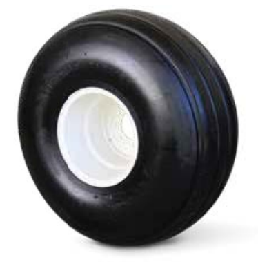
21.5 x 16.1 14 Ply