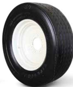
305 x 22.5