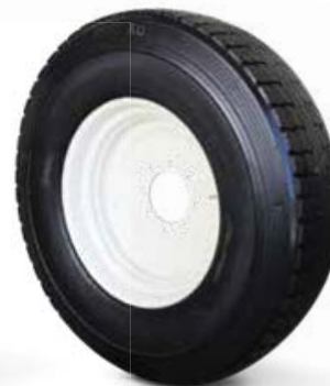
12 or 315 x 22.5