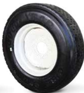
11 x 22.5