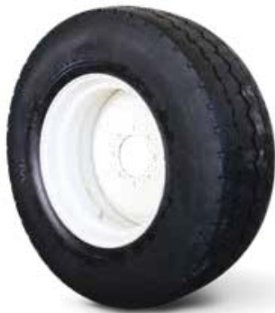
385 x 22.5 (15 x 22.5)