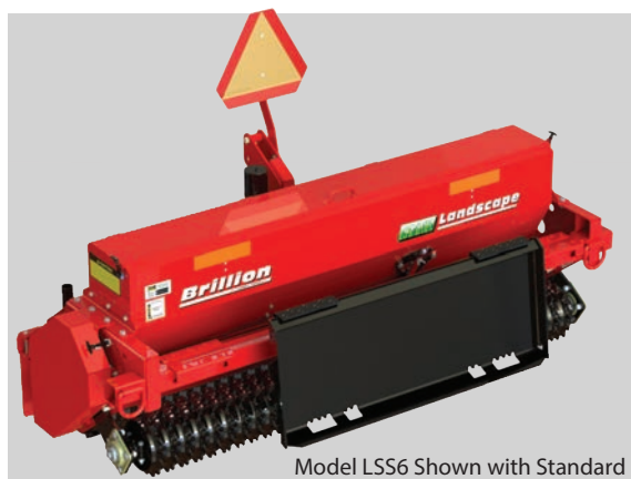
Model LSS6 Shown with Standard Equipment

The five and six foot LSP and LSS Landscape Seeders have been developed from a long line of very successful seeders. These units use blade agitator seed meters that will seed a wide variety of landscape seeds. The three inch meter spacing provides excellent distribution of seed across the full width of the seeder. The five and six foot LSP models are three-point hitch only. The six foot LSS model comes standard with both a three-point hitch and a skid loader adaptor plate for use on most skid loaders. Various options allow these seeders to be adapted to specialty seeding operations as required.