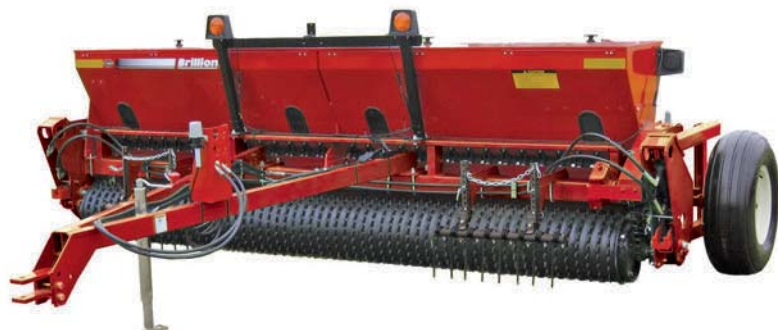
Model SL-3121 with Optional Coil Tine Track Remover Kit

The Turfmaker III Series features large seed boxes and high capacity seed meters for unequalled capacity in seeding grasses and flax. These units lend themselves to commercial sod seeding and other high volume operations. The Turfmaker III Series is offered in both three-point hitch and pull-type models. Pull-type models include all hydraulic equipment and new implement tires. Numerous available options allow the Turfmaker III to be customized to meet special needs.