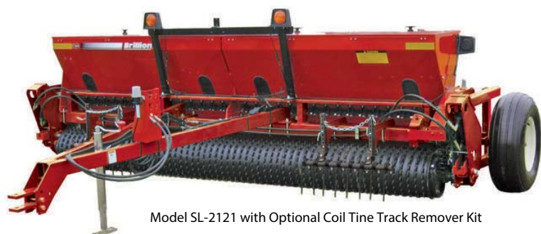
Model SL-2121 with Optional Coil Tine Track Remover Kit

The Turfmaker II Series features large seed boxes and high capacity seed meters for unequalled capacity in seeding grasses and lawn blends. These units lend themselves to sod seeding operations and the high volume landscape customers. The Turfmaker II Series is offered in both three-point hitch and pull-type models. Pull-type models include all hydraulic equipment including new implement tires. Numerous available options allow the Turfmaker II to be customized to meet special needs.