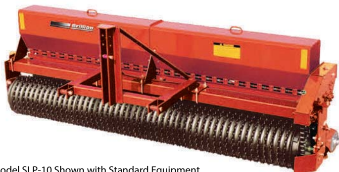
Model SLP-10 Shown with Standard Equipment

The Turfmaker Series raises the bar on the precision seeding of small grass seeds. Large seed box capacity along with narrow meter spacing and the micro-meter adjustment gives this series of Landscape Seeders the edge on the competition. The Turfmaker Series is offered in both three-point hitch and pull-type models. Pull-type models include all hydraulic equipment including new implement tires.