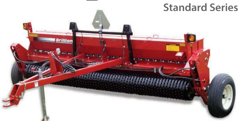
Model SSB-12 Shown with Optional Acre Meter Kit

The SS Series of Agricultural Seeders has been the industry standard when it comes to planting alfalfa, canola and grasses. The Sure Stand concept provides precision seed metering and accurate seed depth placement. This combination offers optimum germination. The Standard Series is offered in both three-point hitch and pull-type models. Pull-type models include all hydraulic equipment including new implement tires.