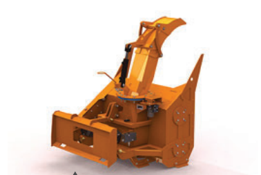
S-250HS Skid Steer model