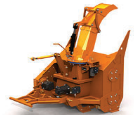
S-250HS Cameleon model