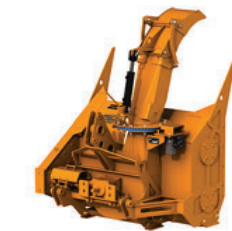
Mechanical S-250HD model