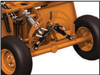
HLL option - Premium Level Indicator