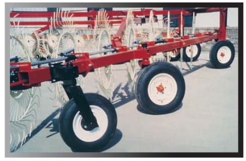
An optional set of 15" front gauge wheels for the 14 Wheel Hi-Capacity rakes help improve float over irrigation tracks or rough ground.

An adjustable brake band on top of the front spindle keeps the front gauge wheels from spinning in rough conditions.