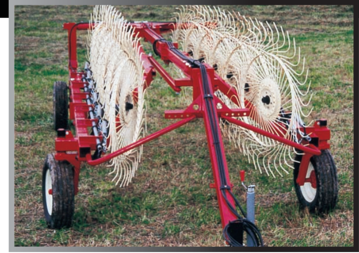
H&S Hi-Capacity rakes fold up to 8'6" or less with the touch of a lever for road transport or to go through gates.

The H&S Hi-Capacity bi-fold rakes have the raking wheels positioned ahead of the rake arms, main frame beams and transport wheels. Coupled with a high and wide end of frame there are no hangup points or restrictions when raking the heaviest of hay crops.