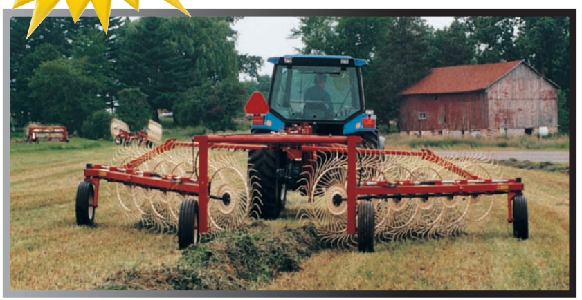
The high open, adjustable rear frame allows for the heaviest crop to pass through. Windrow width adjustment is done with a hand crank.

An optional rake wheel wind board is available for all H&S bi-fold rakes.