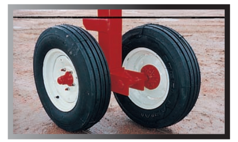
Limited oscillating offset tandem transport wheels assure a smooth, level ride, even over irrigation tracks. Standard on the 14 wheel Hi-Capacity, optional on the 12 wheel Hi-Capacity.