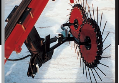
A 2 or 3 wheel center kicker assembly is optional for the Hi-Capacity rakes.

BUILT WITH QUALITY! STRONG AND DEPENDABLE